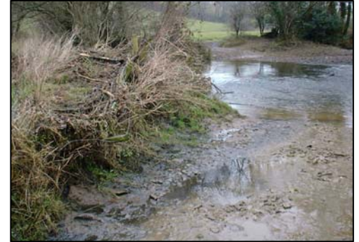
Preventing water pollution can be simple and effective